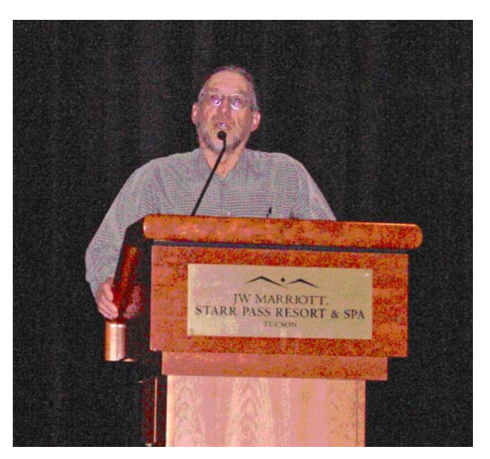
Meteoritical Society Meeting, August 2007

With this newsletter, the characterization of the 2005-2006 season meteorites is complete. Collection by the main team in the Miller Range yielded 4 HED meteorites, a beautiful rare lunar gabbro, a IIIAB iron, a small and unusual bencubbinite, 9 other carbonaceous chondrites (CM, CO), several L chondrite impact melts, and 2 enstatite chondrites. Searching at MacKay Glacier resulted in 9 carbonaceous chondrites (CK, CM, CV) and a mesosiderite. Taylor Glacier samples included an L5 and a IIE iron. A summary of the finds for '05 samples (or any other season) can be generated using our advanced search on the classification database on our webpage: http://curator.jsc.nasa.gov/antmet/query.cfm.