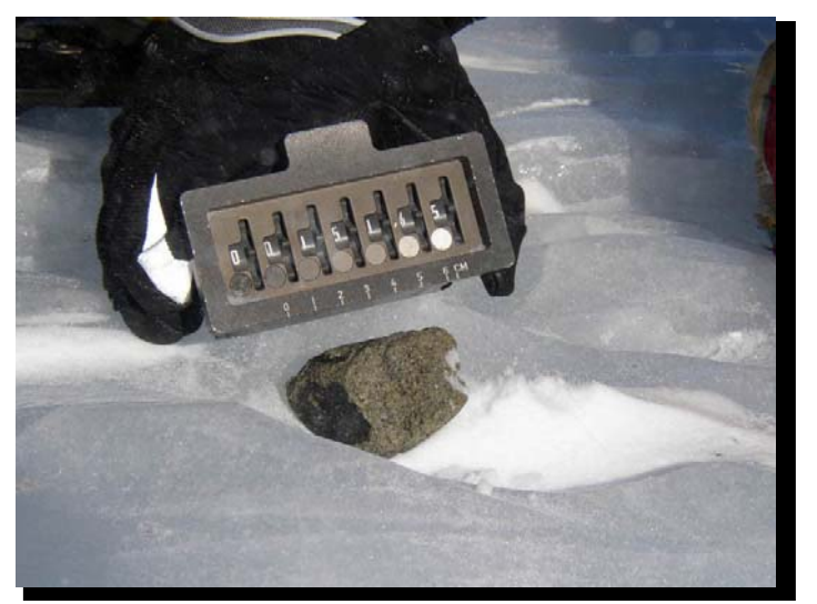
RBT 04262, the larger of the two shergottites

The olivine-phyric shergottites are characterized by the presence of maskelynite, and have Fe/Mn compositions clearly within martian meteorite values. The presence of both olivine and pyroxene phenocrysts in these shergottites make them similar (perhaps) to several other shergottites such as DaG 476/489, NWA 1195, 2046 and 2626. Similarities and differences between these new samples and other shergottites await further detailed study by the martian meteorite community.