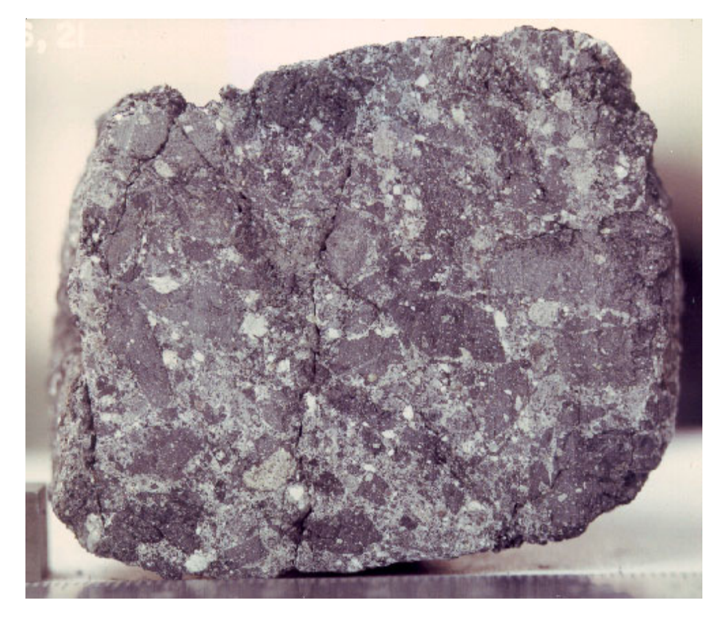
Figure 47 - Sawn surface of fragmental lunar breccia 14306 illustrating the polymict nature of lunar breccias. This is a sample of the Fra Mauro Formation and is typical of ejecta from large basins. NASA photo no. 72-22103

Compared with pristine lunar rock, all lunar breccias contain relatively high Ir and Au contents. It is thought that these trace elements come from meteoritic material that has bombarded the Moon. Distinctive chemical signatures of the added meteoritic component have even been used to identify the lunar basin of origin (Hertogen et al. 1977). Apparently, the vaporized meteorite becomes entrained and thoroughly mixed with the target material during a single impact. Calculations show that about 1 to 2 weight percent of meteorite material has been admixed, into lunar breccias. Melted iron particles from meteorites can be found in the matrix of lunar breccias. Other meteorite minerals are completely obliterated.