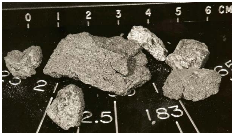
Figure 4: Largest (> 1 cm) particles from 12057 (from bottom of rock box). S69-60962.

Keil et al. (1971), Bunch et al. (1972) and Busche et al. (1971) studied small lithic particles and glasses from 12057.