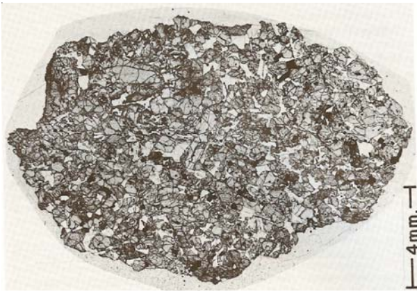
Figure 5: Thin section photo of 12057, 35 (Dence et al. 1971).

The carbon and nitrogen contents of 12057 have not been reported.