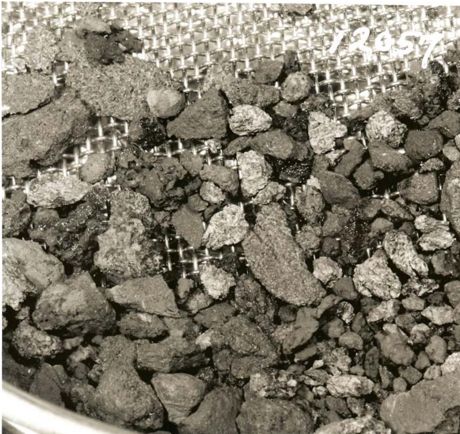
Figure 3: Close-up photo of coarse-fines from 12057 (figure 1). S69-60961.