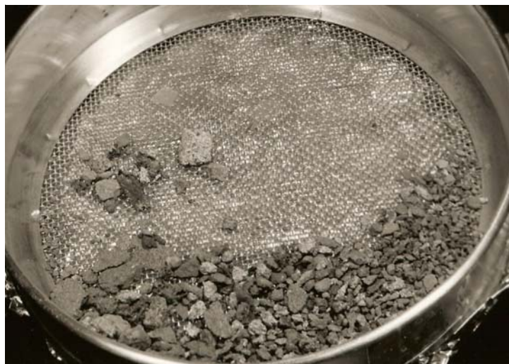
Figure 1: Coarse-fine particles from 12057 on 1 mm sieve. S69-60959.