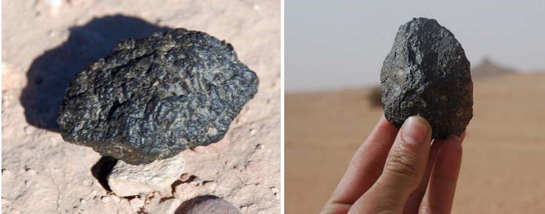
Figure 1: Field photos of NWA 4936 (left) and NWA 5406 (right) (photos courtesy of R. Korotev and G. Hupe).