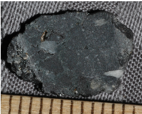
Figure 2: Cut slice through NWA 5406, illustrating the dark matrix and white anorthositic clasts

Northwest Africa 4936 was found in 2007 in two pieces weighing 179 g (Fig. 1; Weisberg et al., 2009a). Northwest Africa 5406 as found in 2008 in several pieces (Fig. 1; Weisberg et al., 2009). They have a dark grey matrix with light colored and white clasts (Fig. 2). They also have an anorthositic bulk composition, which overlaps in both major and trace elements, with Apollo 16 regolith (Fig. 3 and 4). Additionally, the feldspathic component of NWA 4936/5406 includes some type of magnesian anorthosite (Korotev et al. 2003; Takeda et al. 2006) as opposed to the ferroan anorthosite that is common at the Apollo 16 site (Korotev et al., 2009b).