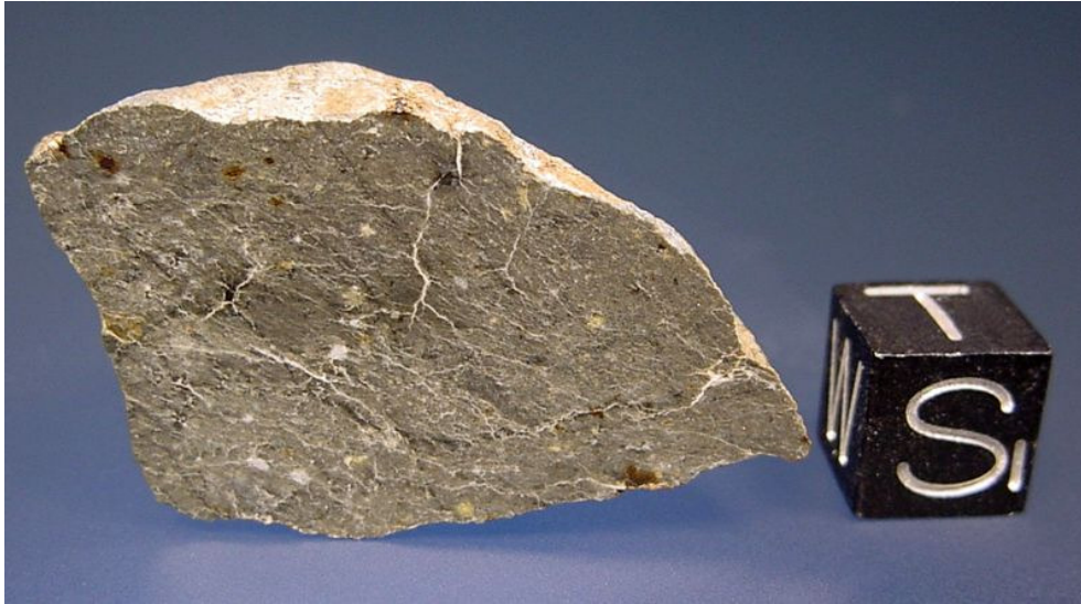
Figure 2: Sawn face of NWA 4932 with 1 cm cube.