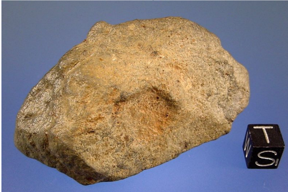
Figure 1: NWA 4932 with 1 cm cube for scale.