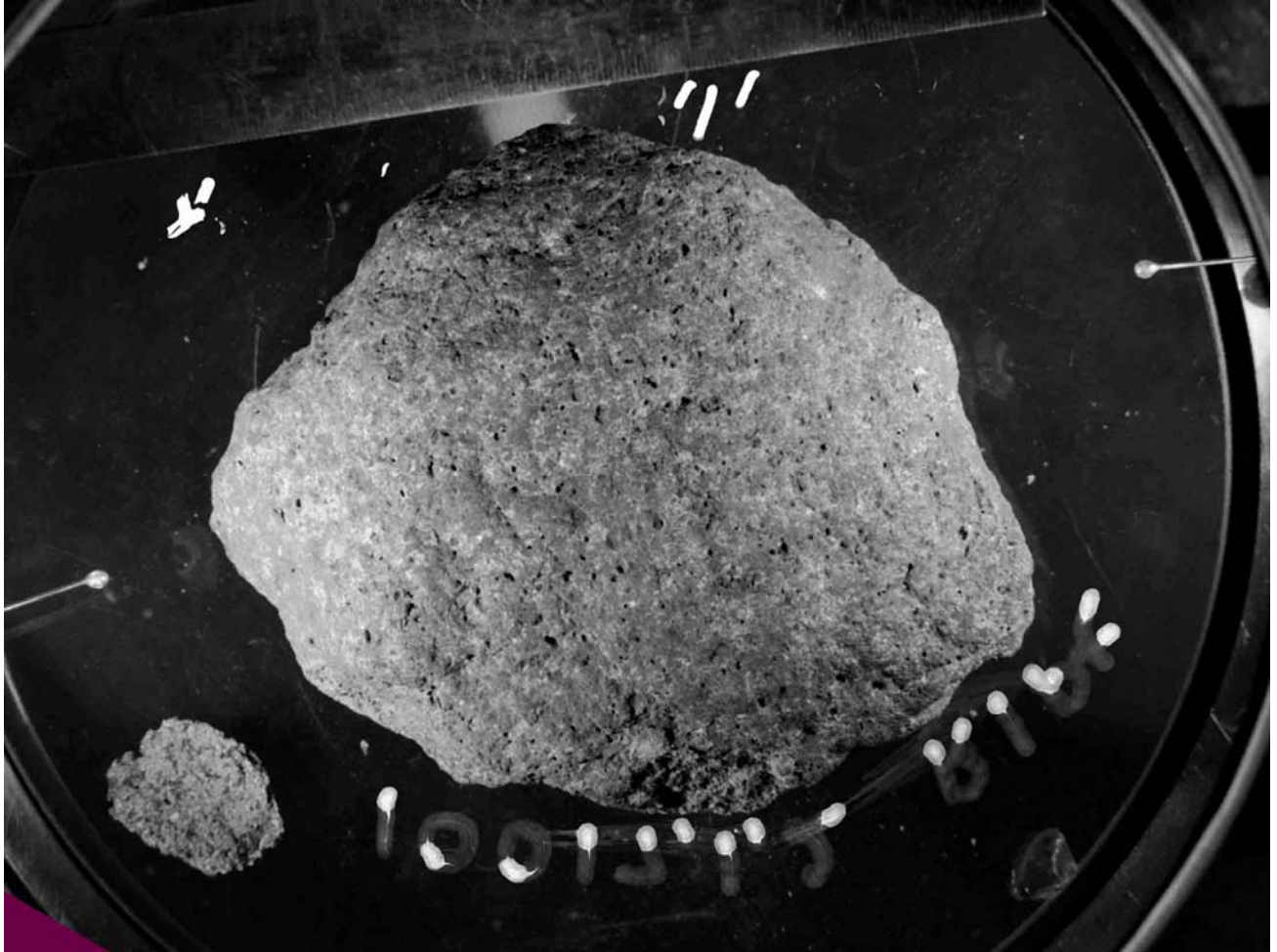
10017,0 Original PET Photo (S-69-47560)