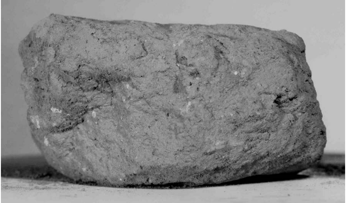
Width of image is approximately 9 cm; S-71-20985