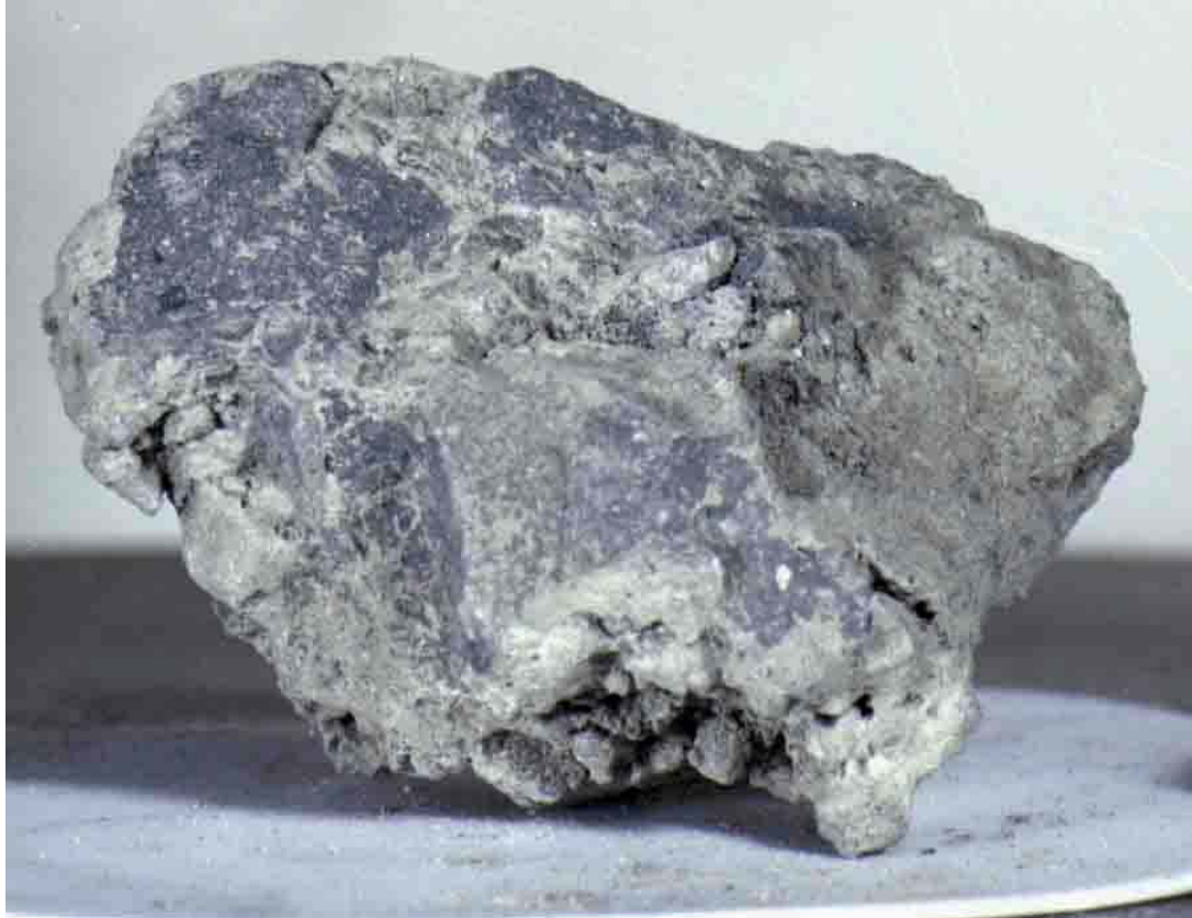
Width of image approximately 5 cm, S-71-30338