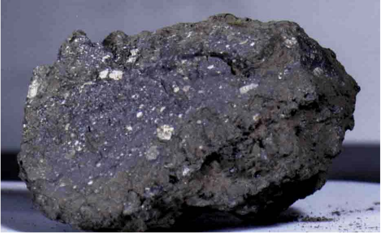
Width of image is approximately 5 cm, S71-30351