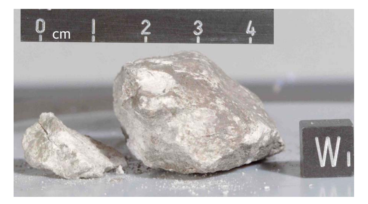
FIGURE 1. S-72-41416.

<u>INTRODUCTION</u>: 60055 is a homogeneous, friable, cataclastic anorthosite which is chemically pristine. Original surface features have been obscured due to its friable, dusty nature (Fig. 1). This rock was collected about 170 m south-southwest of the Lunar Module. The sample was disturbed prior to photographing, hence burial and orientation data were lost.