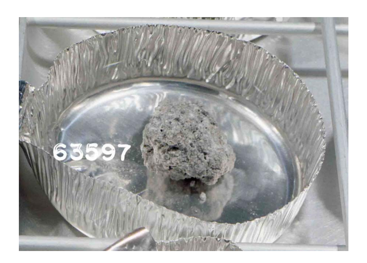
FIGURE 1. Aluminum cup bottom is 2 inches in diameter. S-72-42082.

<u>PROCESSING AND SUBDIVISIONS</u>: Thin sections ,3 and ,4 were cut from a single representative chip.