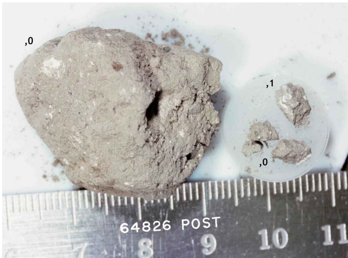
FIGURE 1. Smallest scale division in mm. S-72-55309.

INTRODUCTION: 64826 is a friable, medium gray, clastic breccia (Fig. 1). It is a rake sample from the rim of a small, subdued crater on Stone Mountain. Zap pits are absent.