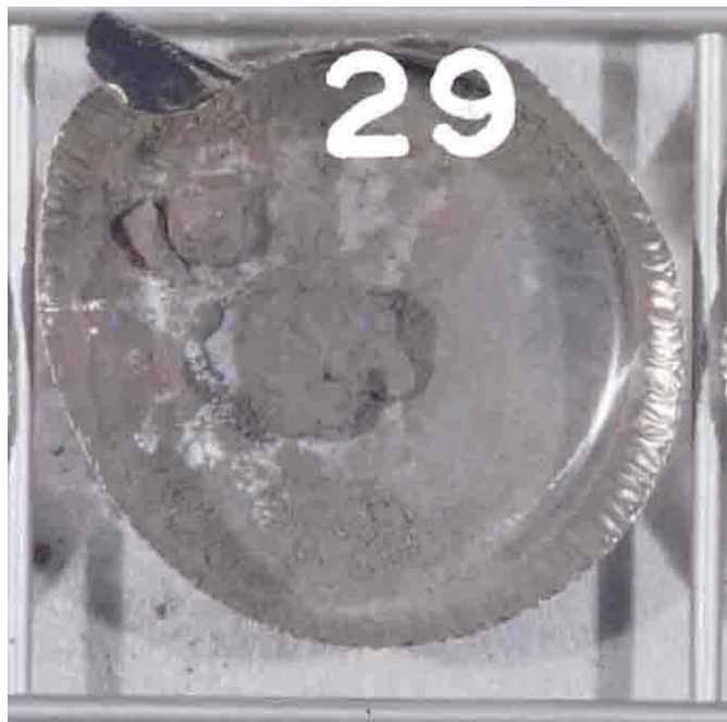
FIGURE 1. Aluminum cup bottom is 2 inches in diameter. S-72-43351.

PROCESSING AND SUBDIVISIONS : In 1973 the rock was split and the large glass bead extracted as ,1 (0.03 g) for a thin section.