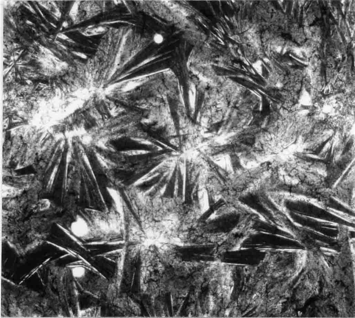
FIGURE 2. 67705,5. General view, ppl. Width 2 mm.

PROCESSING AND SUBDIVISIONS : A single chip ,1 was taken (Fig. 1) to make thin sections ,5 ,6 and ,7. It was a representative chip with a large white clast.