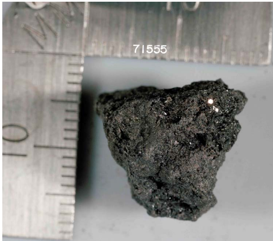
Figure 1: Hand specimen photograph of 71555,0. Small divisions on scale are in millimeters.

Murali et al. (1977) reported the whole-rock composition of 71555,1 in a study of Apollo 17 rake samples (Table 1). 71555 is classified as a Type A Apollo 17 high-Ti basalt, based on the whole-rock classification of Rhodes et al. (1976) and Warner et al. (1979). This sample contains 13.0 wt% TiO 2 , with a MG# of 46.3. The REE profile (Fig. 3) is relatively flat, except