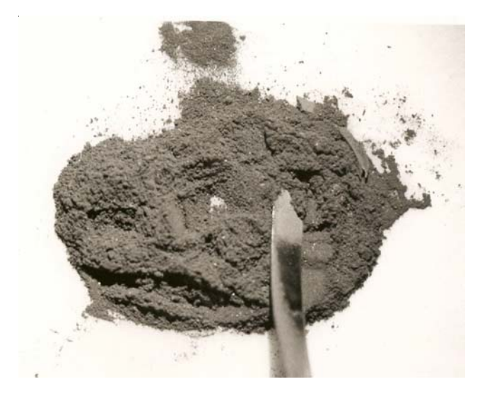
Figure 1: Photo of a portion of 10010. Spatula about 3 mm wide. S69-45229.