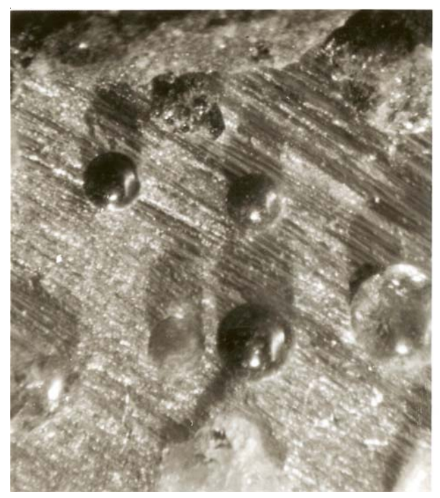
Figure 2: Small glass spheres found in 10010. Largest sphere is 3 mm. S69-45181.